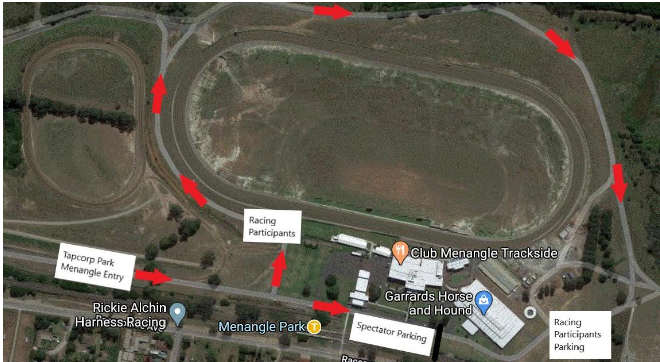
Figure 1. Entry to Premises

Racing Participants and Spectators will be separated before the Club <Menangle Admin building. Racing participants will travel around the back of the main track to their car park at the rear of the stable area. Spectators will continue to the main carpark